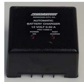
Battery Charger (Optional)