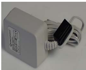
AC Power Supply (Optional)