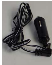
DC Power Cable (Supplied)