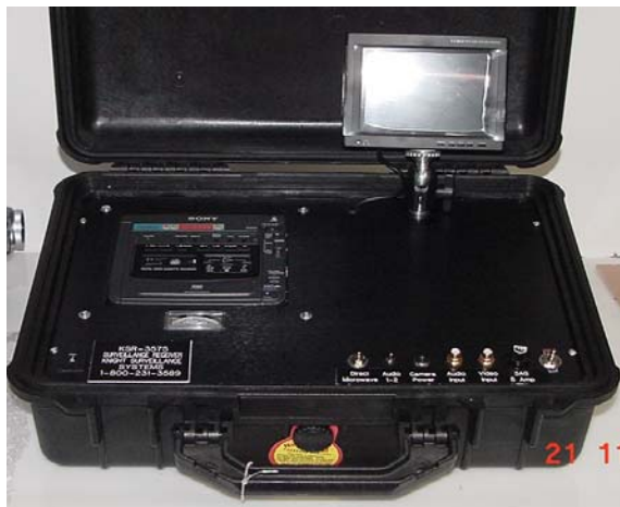
Model 3575 Video Microwave Receiver Kit (Early Edition)