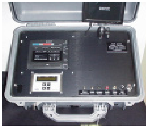
Model KSR-3550 Receiver Kit