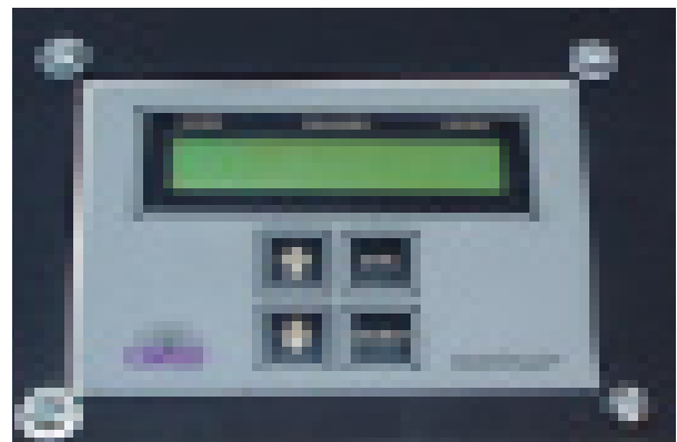
MR Video Microwave Receiver

Visit our web site www.covert-systems.com