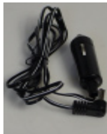
DC Power Cable