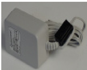
AC Power Supply (Optional)