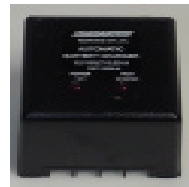
Battery Charger (Optional)