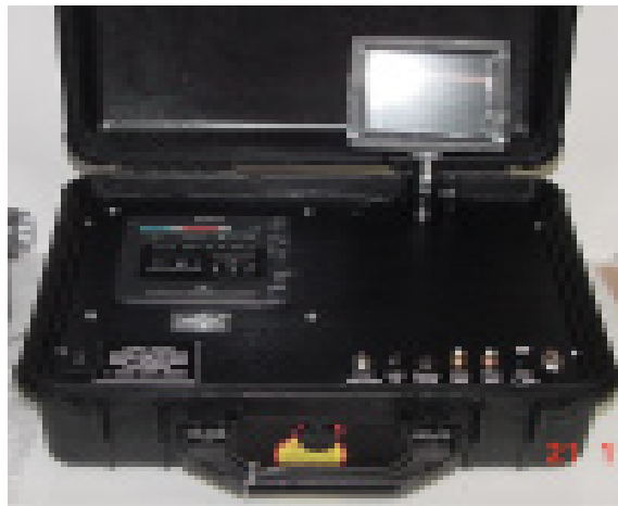
Model 3575 Video Microwave Receiver Kit (Sony Recorder Edition)